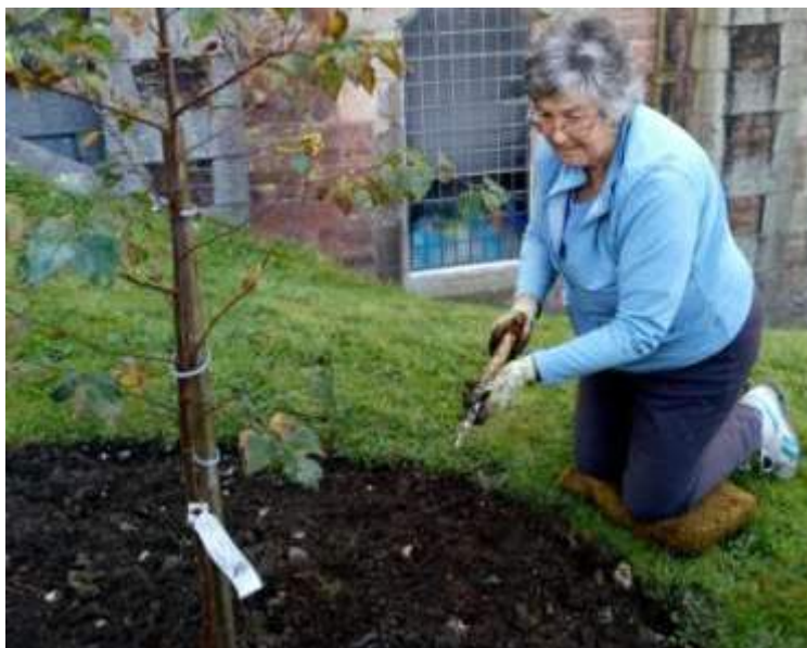
Looking forward to spring across the generations – bulb planting at St Andrew's