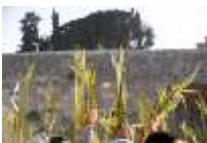
The Jewish Festival of Tabernacles

As this reading begins with Jesus leaving the Jewish Festival of Tabernacles on which Christians base their Harvest Festival. In this short reading, Jesus proclaims that he is the source of living water. That He is the answer to those who search for a meaning for life, a means to approach God. The reading ends with the Gospel writer explaining that the Holy Spirit had not yet been given. The people must wait for Jesus to be glorified.