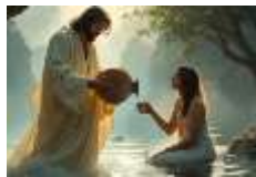
Jesus is the living water