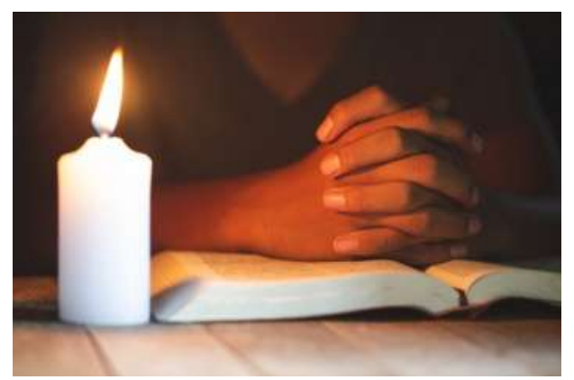
JUST A THOUGHT: Remember you are only an instrument, and an instrument is nothing until it is lifted

SATURDAY JULY 26: Anne & Joachim Parents of the BVM "I will sing your praises among the nations" Psalm 108 vv4 PRAY FOR THOSE WHO ARE PARENTS AND GRANDPARENTS