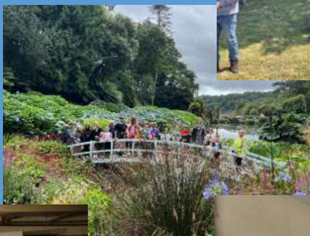
Holiday Club 2023 pose on the bridge In Trebah Gardens.

Church yard clean-ups and garden parties!