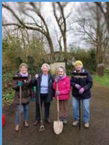
The Redruth Randoms Musical group.

THE CHURCH OF ENGLAND IN AND AROUND REDRUTH SHARING GOD'S WELCOME & GROWING DISCIPLES