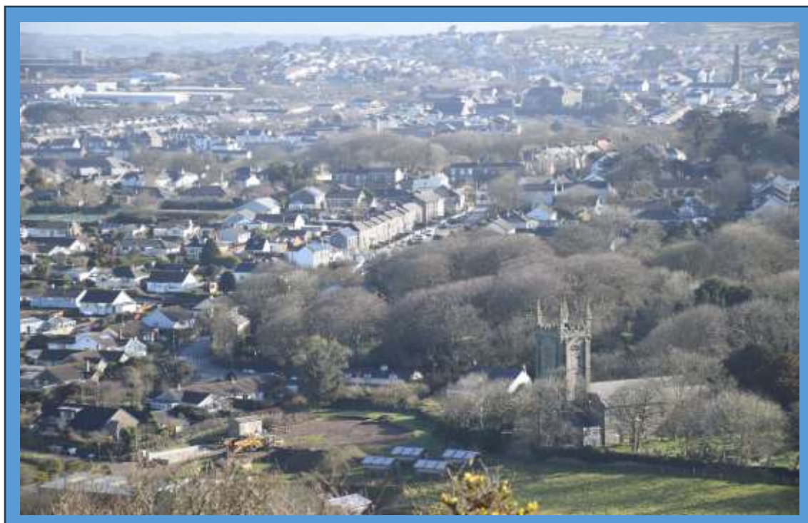
The town of Redruth with St Euny Church In the foreground